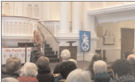
'No Faith in Trident' service at Hinde Street Methodist Church

CCND took part, as usual, in the annual Ash Wednesday Witness at the Ministry of Defence and many of our members came to London for the National "Stop Trident" March and Demonstration on 27th February. The preceding Liturgy at Hinde Street Methodist Church was particularly appreciated.