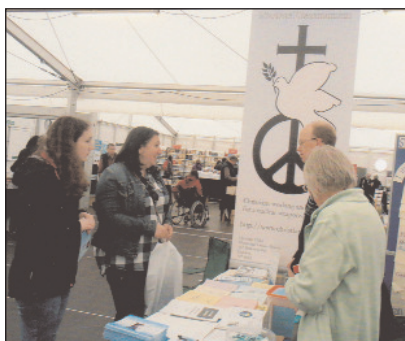
CCND stall at 'Spring Harvest'

We have found a useful way to reach out to church members is by attending their denominational conferences. For a number of years, CCND has had a presence at Anglican Synods and the RC Justice and Peace Conference in Swanwick as well as the Christian Arts Festival, "Greenbelt". This year, we added "Spring Harvest" in Minehead at Easter, a gathering of Evangelical families, where we found a great deal of interest in our campaign. We hope to expand this area of