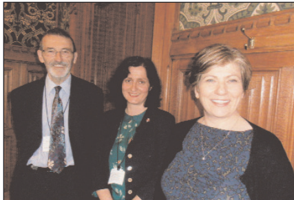
Emily Thornberry MP wasn't at the meeting but did put in a brief appearance for a photograph