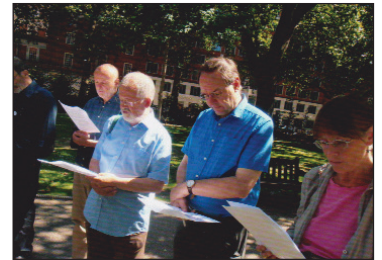
Prayers in Tavistock Square on Hiroshima Day

joined the International Fast at the MOD and we had a display in Tavistock Square during the London Region Annual Commemoration, which this year had an Interfaith theme. Many of our members took part in their own regional events. A vigil was held at Aldermaston to mark the beginning of Advent, immediately after the 2015 AGM which was held at the Burghfield Church Hall.