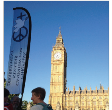
CCND banner in Parliament Square

On 13th July, we joined the CND Mass Lobby of Parliament. This was preceded by a short liturgy in St Martin-in-the-Fields followed by an hour-long vigil in Parliament Square.